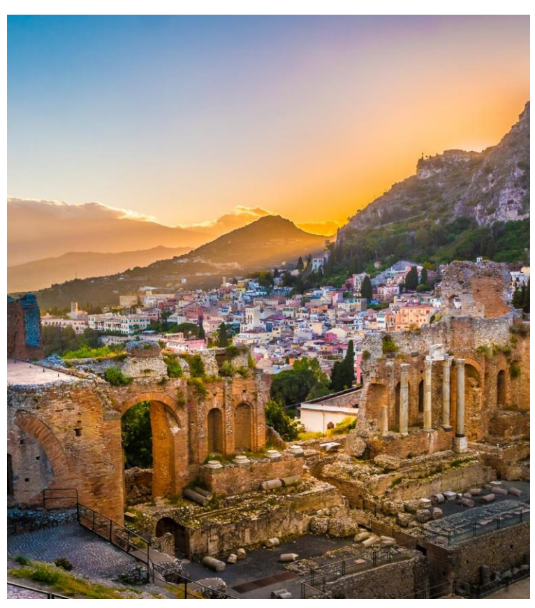
12 Days ● 19 Meals : 11 Breakfasts, 8 Dinners

HIGHLIGHTS... Palermo, Monreale, Choices on Tour, Agrigento, Valley of the Temples, Taormina, Giardini Naxos, Mt. Etna Volcano, Matera, Sorrento, Amalfi Coast, Pompeii